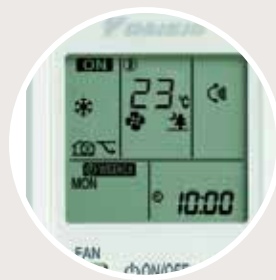
Infrared remote control (Standard) ARC452A1