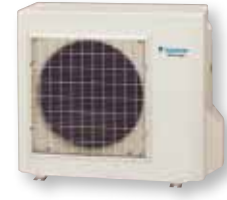
Outdoor unit RXS50G