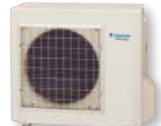
Outdoor unit RKS50G