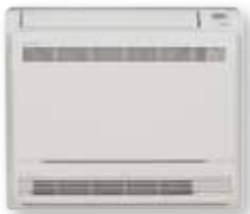
Indoor unit FVXS25-35-50F

Notes: 1) Energy label: scale from A (most efficient) to G (less efficient) - 2) Annual energy consumption: based on average use of 500 running hours per year at full load (=nominal conditions) - 3) V1 = 1~, 220-240V, 50Hz - 4) Nominal cooling capacities are based on: indoor temperature 27°CDB / 19°CWB - outdoor temperature 35°CDB/24°CWB - refrigerant piping length 5 m - level difference 0m - 5) Nominal heating capacities are based on: indoor temperature 20°CDB - outdoor temperature 7°CDB / 6°CWB - refrigerant piping length 5 m - level difference 0m - 6) Capacities are net, including deduction for cooling (an addition for heating) for indoor fan motor heat - 7) Units should be selected on nominal capacity. Max. capacity is limited to peak periods - 8) The sound pressure level is measured via a microphone at a certain distance from the unit (for measuring conditions: please refer to the technical databooks) - 9) The sound power is an absolute value indicating the "power" which a sound source generates.